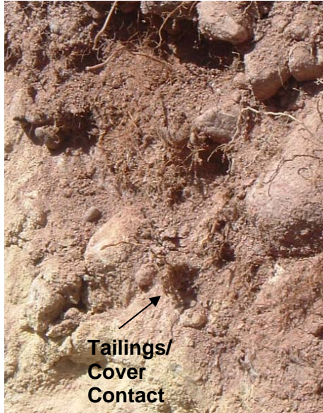
Figure 3. Matted roots in Tailings 4W 60 cm cover material

Observed rooting density in the Tailings 4W and SW 2 areas is presented in Table 4. Mean root size was fine or very fine at all locations with very fine roots most abundant at the 0-10 cm ac sampling position. Mean root abundance was common at 0-10 and 10-20 cm bgs under all treatments