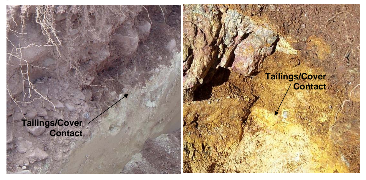
Figure 1. Typical tailings/cover contact in the Tailings 4W trenches on left, precipitate staining on above the tailings/cover system contact in the CTSA South Slope (right) area

Demonstration cover material, and up to depths of 20 cm ac in the CTSA South Slope Cover material (Figure 1). The degree and depth of staining was highly variable within individual trenches. Microscopic analyses were conducted to classify the precipitate and assess whether the staining was from tailings mixed with the cover material. These analyses indicated staining was due to iron precipitates (e.g. jarosite) coating Glance Conglomerate cover material, suggesting acid neutralization and precipitation reactions had occurred since placement of the cover material.